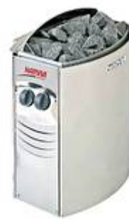
BC 60 BC 80 BC 90