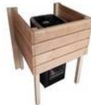
Heater security fence for wood burning heaters