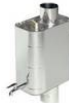
22 liters water tank for burning heaters