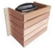
Heater security fence for electric ovens