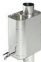
22 liters water tank for burning heaters