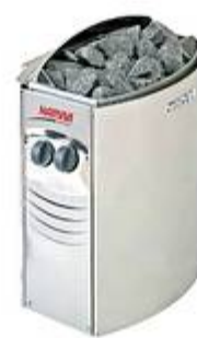
BC 60 BC 80 BC 90