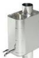
22 liters water tank for burning heaters