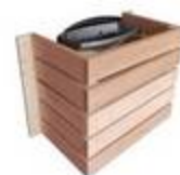
Heater security fence for electric ovens