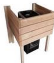
Heater security fence for wood burning heaters