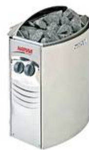
BC 60 BC 80 BC 90