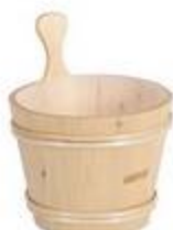
Wooden bucket for water (with plastic 4 liters)