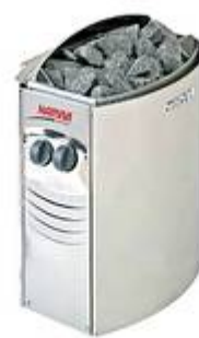
BC 60 BC 80 BC 90