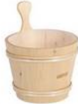
Wooden bucket for water (with plastic 4 liters)