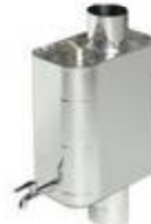
22 liters water tank for burning heaters