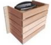
Heater security fence for electric ovens