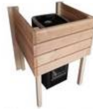
Heater security fence for wood burning heaters